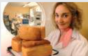
High Quality Gluten Free Breads