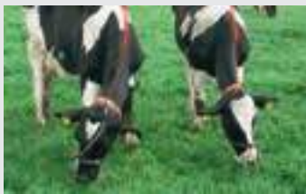
Reducing Greenhouse Gas Emissions