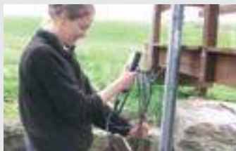
Maintaining Clean Water