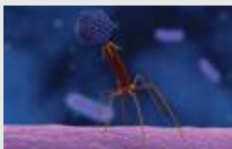
Phage Therapy for Controlling MRSA