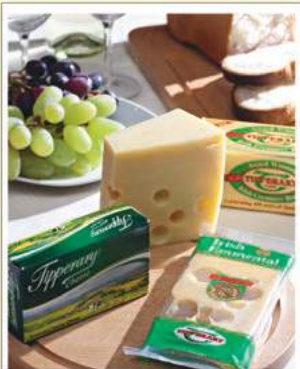
Award Winning Dairy Products