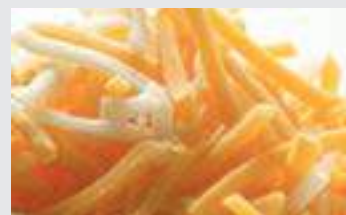
New Product Development