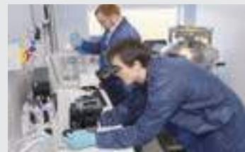
Sexing semen for Animal Breeding