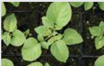
Breeding New Potato Varieties