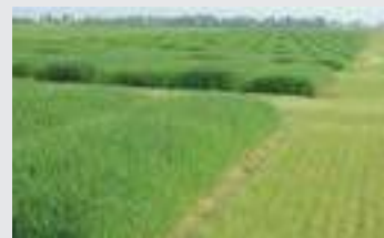
Grass based Livestock Systems