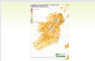
Satellite Mapping for Precision Farming